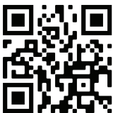
Stop 5 - Abbey Grounds